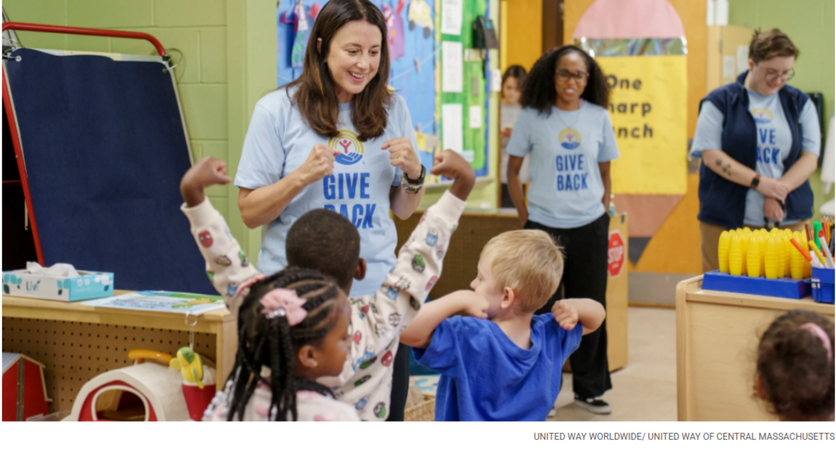
UNITED WAY WORLDWIDE/UNITED WAY OF CENTRAL MASSACHUSETTS

By Drew Lindsay and Brian O'Leary | OCTOBER 7, 2025