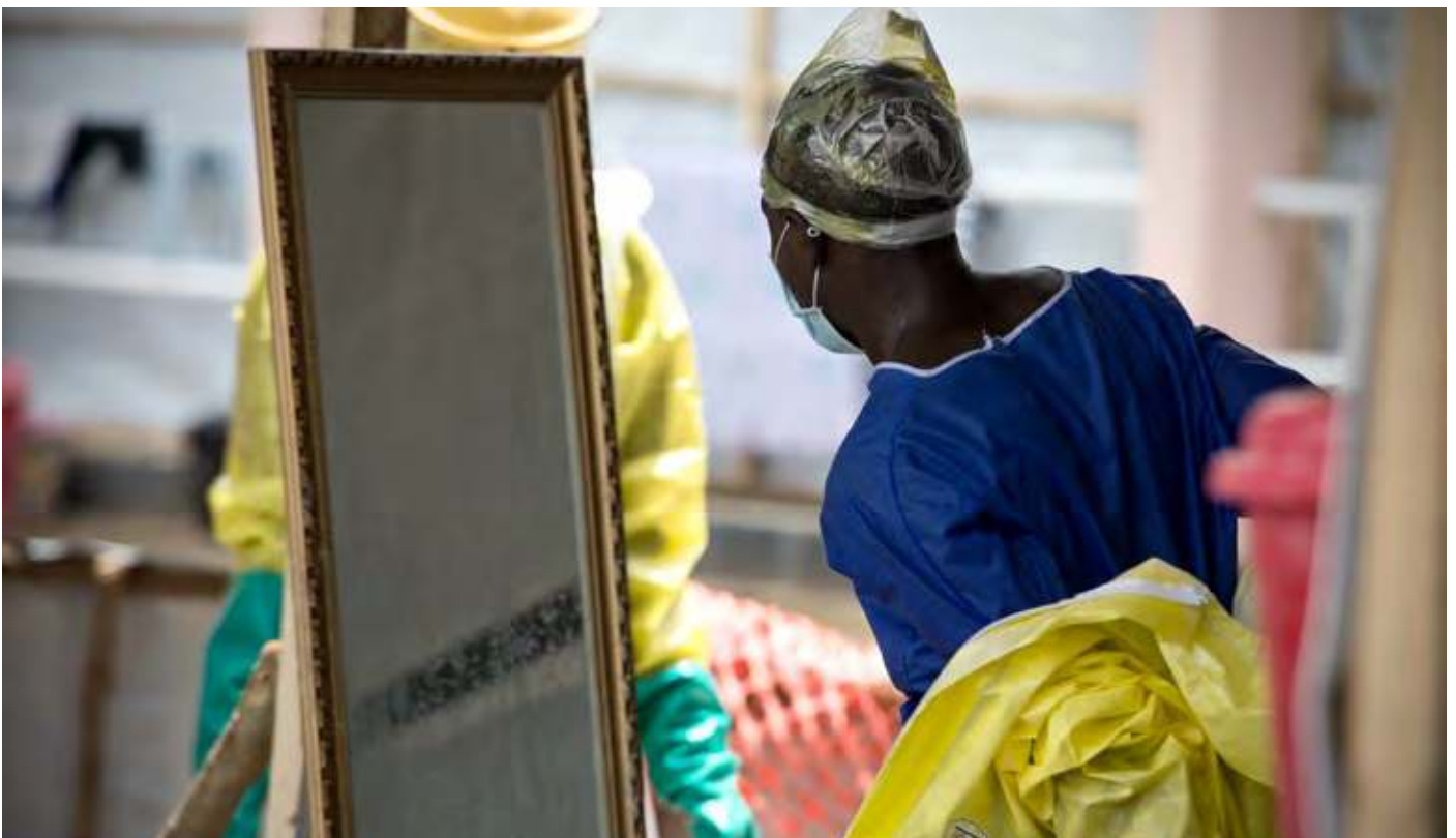
Top: Medical worker puts on protective equipment during the Ebola outbreak in 2014, Sierra Leone

“I am afraid that health workers might not find the cure for COVID-19 and the world will continue to be locked down.” Praise, 13, Liberia, 2020 27